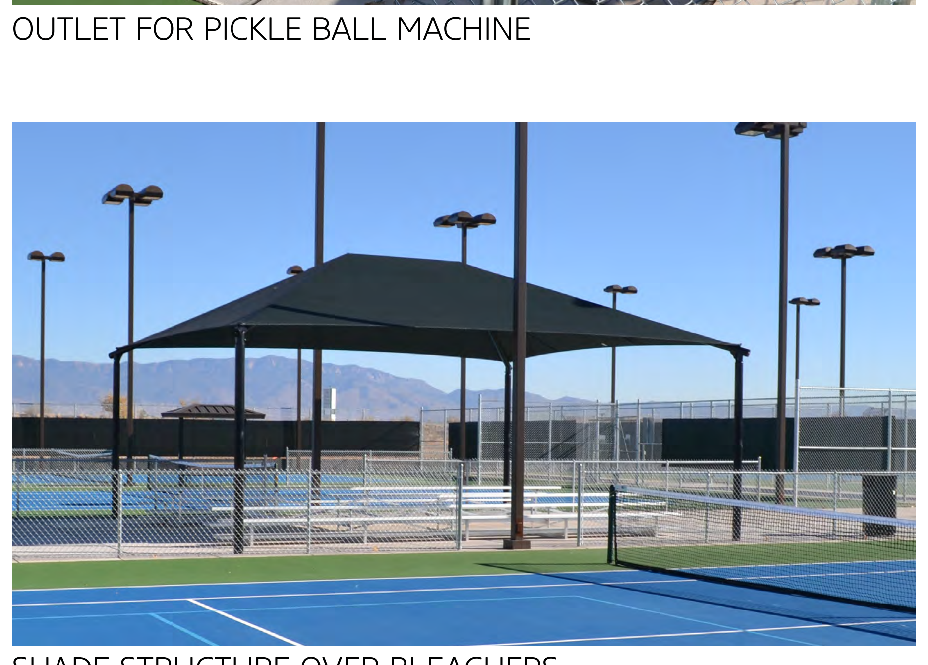
SHADE STRUCTURE OVER BLEACHERS