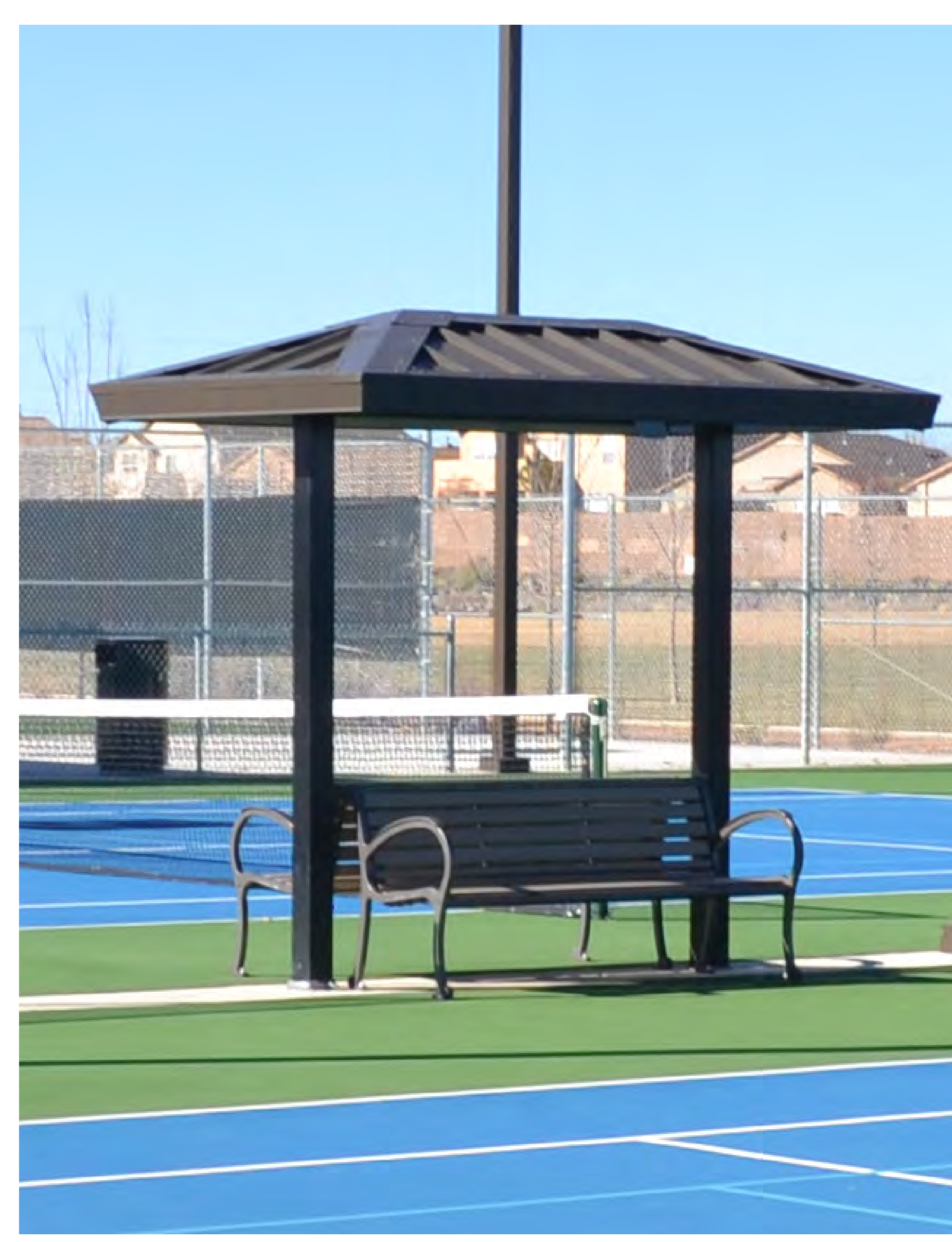
BENCH AND SHADE FOR PLAYERS